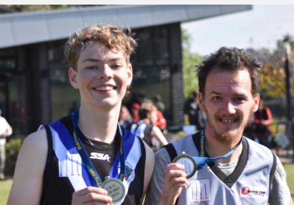
i-drivesafety T.R.Y. Award Round

Recipients - Mazenod | Ringwood Spiders | Ballarat Bulldogs | Cranbourne Eagles