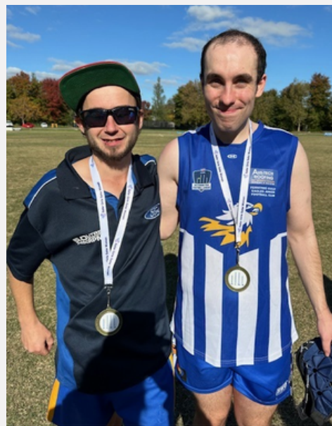
Safer Girls Safer Women T.R.Y. Award Round

Recipients - Ferntree Gully Eagles | Central Conference