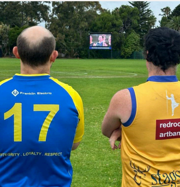
Williamstown Seagulls play the video before their home games.